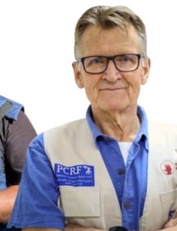
MADS GILBERT PHYSICIAN & HUMANITARIAN ACTIVIST